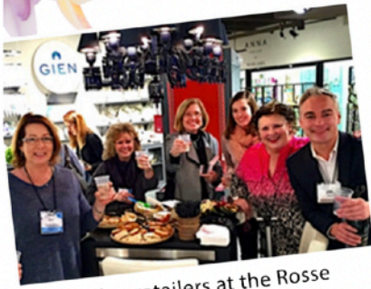
Bridge retailers at the Rosse showroom in Atlanta

Babcock Gifts in TN Bailey's Jewelry in NC Barbara Stewart in KY BC Clark Jewelers in OK Bebe's in OK Breed & Co. in TX Cottage Shop in GA Fisherman's Wife in NC Fragile in GA Friend & Co. in LA Glass Bazaar in TN