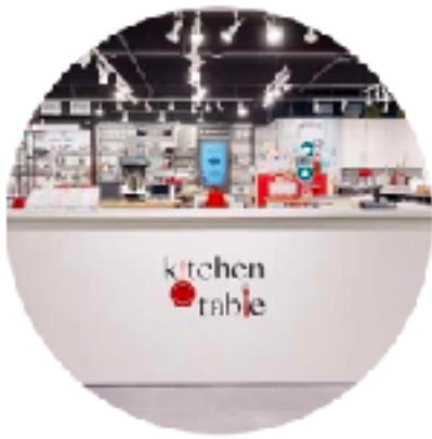
Example of a showroom at the trade show.

Nice work: You wrote a nice order at the Dallas or Atlanta show.